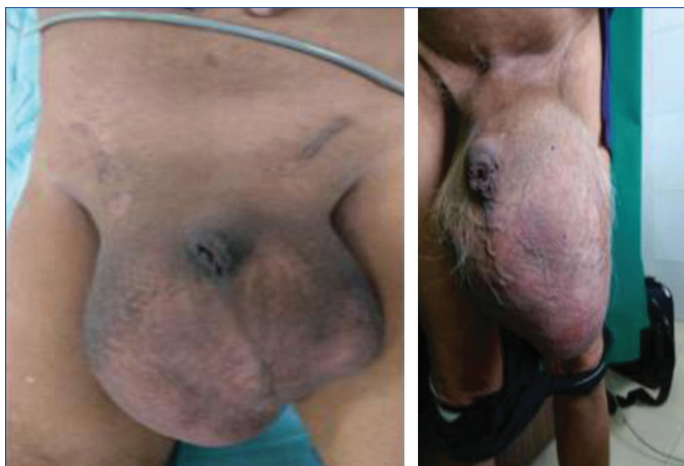
[Table/Fig-4]: Large bilateral recurrent inguinal hernia operated using bilayer mesh device. [Table/Fig-5]: Large left inguinal hernia operated using PHS device. (Images from left to right)