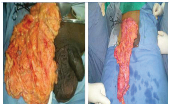
[Table/Fig-8]: Intraoperative finding of omentum as content.

The mean duration of surgery was 61.5 minutes. The most frequently found content of the hernia was omentum [Table/Fig-8]. All patients received 2 doses of injectable amoxycillin and clavulanic acid 1.2 g, with exception of diabetic patients (N=4), who received four such doses. All patients were given the same postoperative analgesia regime-two doses of paracetamol 1 g Intravenous (IV) injection eight hourly in the immediate postoperative period. Diclofenac 100 mg IV injection was kept as an SOS drug. They were then given only paracetamol 650 mg tablet thrice daily for five days from the first postoperative day. None of the patients required additional analgesics. All patients were ambulated on the 1 st postoperative day. The mean postoperative stay was for 4±2 days.